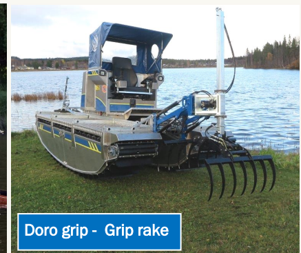
Doro grip - Grip rake