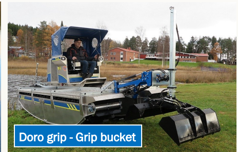
Doro grip - Grip bucket