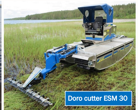
Doro cutter ESM 30