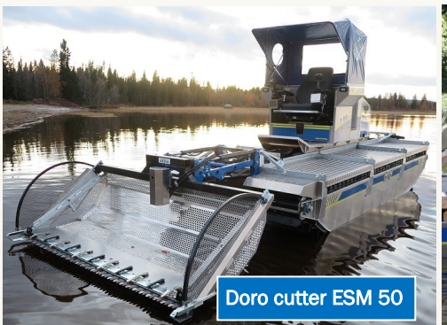
Doro cutter ESM 50