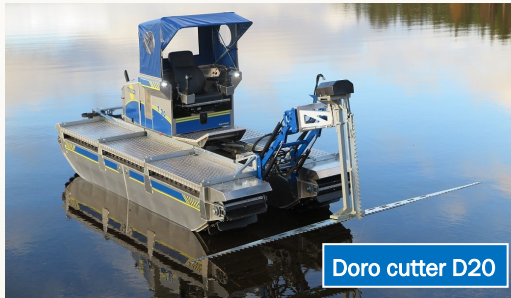
Doro cutter D20