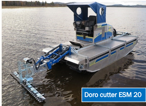
Doro cutter ESM 20

Thanks to its high performance, the T50 is the excellent tool carrier for power demanding tools, such as the Doro pumps. All tools and accessories are compatible with the Truxor T50. Technical information is available at the website: www.doroteamekaniska.se